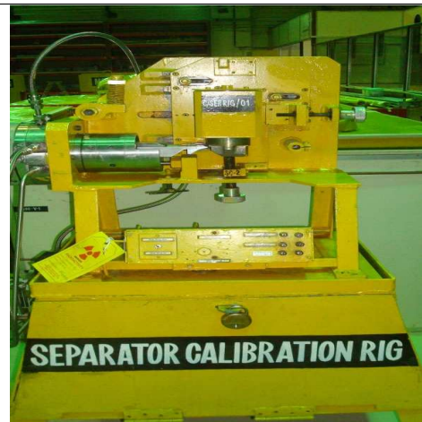
Separator Test Facility