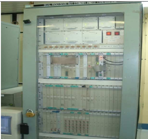
DPHS Card Test Facility

Mini Power Station: It is a working model of conventional process in a system consisting of steam generator, turbine, condenser, hot-well, CEP, dearator, feed pump, CCW pump & NDCT to train new entrants.