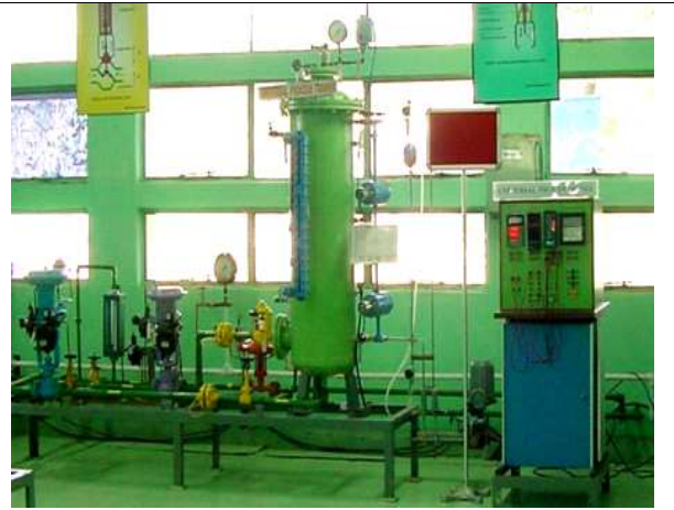
Mini Power Station