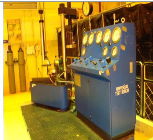
Active Valve Test Facility