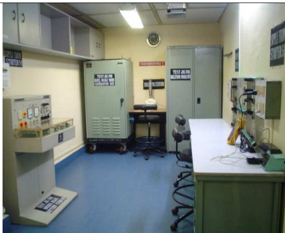
Electrical Card Testing Shop