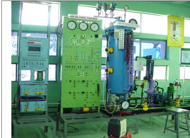
Universal Process Loop