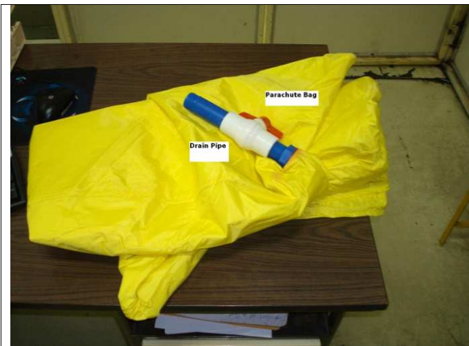
Figure 8. Folded Parachute Bag