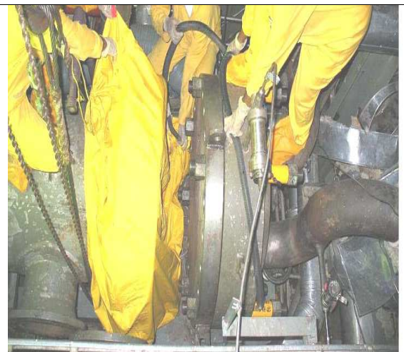
Figure9. Use of parachute bag in Heat Exchanger draining.